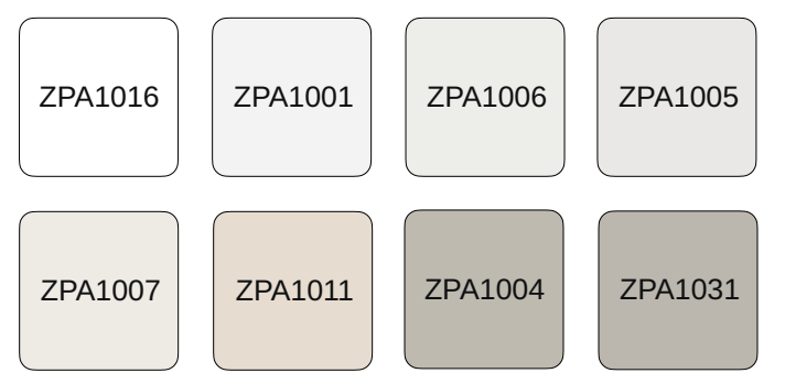
Illustration only. Contact us to request a sample. Color matching and additional colors available from our extensive color library.