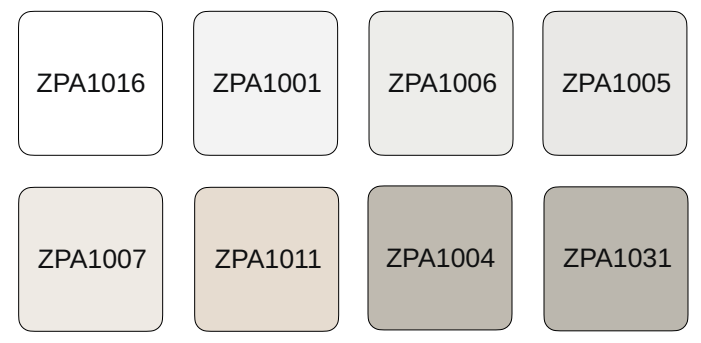
Illustration only. Contact us to request a sample. Color matching and additional colors available from our extensive color library.