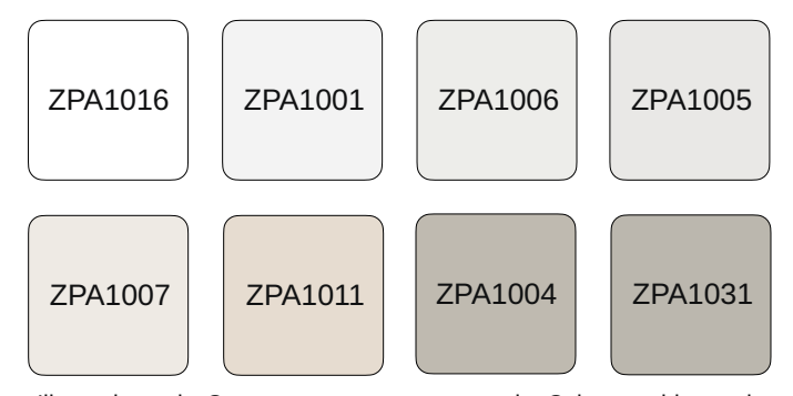
Illustration only. Contact us to request a sample. Color matching and additional colors available from our extensive color library.