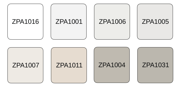
Illustration only. Contact us to request a sample. Color matching and additional colors available from our extensive color library.